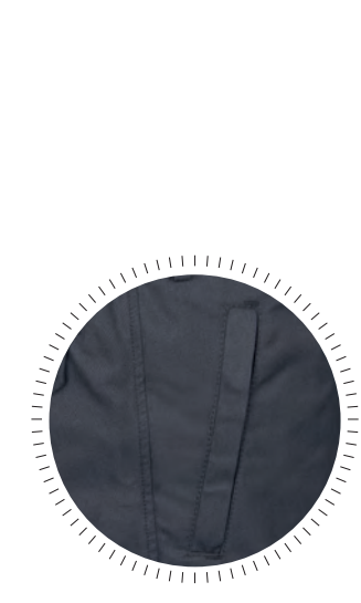
Also available with two side welt pockets with covered zips acc. to VWV

Two-coloured • waistband with hook fastening and elasticated on both sides • 2 pleats at the front of the trousers • covered zip • 2 side pockets • 2 recessed back pockets with flap and hook & loop fastening • 2 bellow pockets on the side seam with flaps and hook & loop fastening, flaps with red trim and underlined "FEUERWEHR" embroidery • right-hand flap with opening for pen • lined crotch • seat seam designed to be easy to modify.