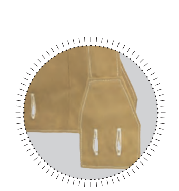
With the braces the trousers can be turned into hib and brace trousers in no time at all