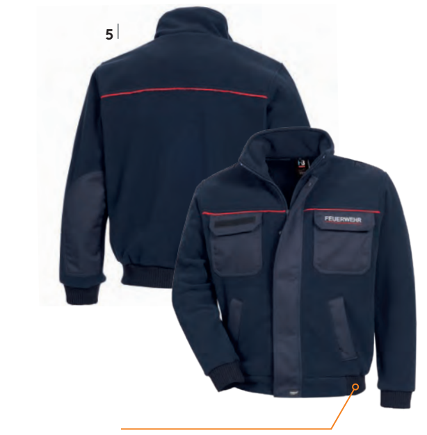
Hem with ribbed structure

Two-coloured • decorative red piping on front and back • shoulder tunnel for rank badge • stand-up collar with zip fastening • front zipper with snap fastener covered on both sides • 2 breast pockets with flaps and hook & loop fastening • right-hand flap with hook & loop tape for name badge • left-hand flap with underlined "FEUERWEHR" embroidery • 2 side pockets as welt pockets • sleeves with inner knit cuffs and underarm reinforcement • hem with ribbed structure.